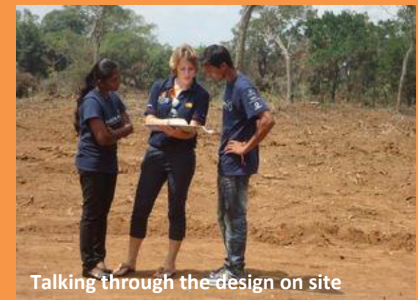
Talking through the design on site