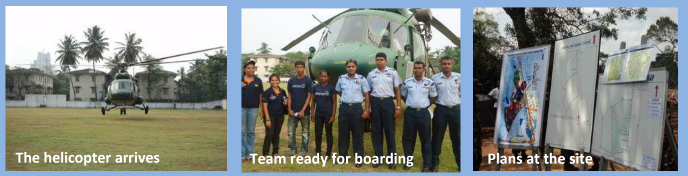
The helicopter arrives

The trip was the first time the two cricket icons had travelled beyond the Southern areas of the country and were blown away by what they saw. Since the civil war between the LTTE and the Sri Lankan Government which began almost 30 years ago there has been barely any development in this part of the country. Having been allocated land for the project in November 2010 the Sri Lankan Army has carried out extensive de-mining and are close to finishing the 50 acre site. Once completed it will be possible for the project team to explore the area fully and begin the process of design and building.