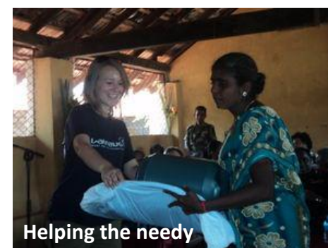
Helping the needy