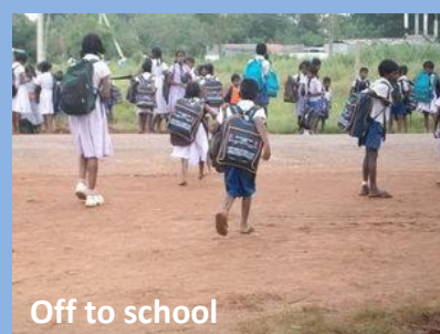
Off to school