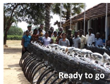
Ready to go