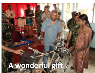
A wonderful gift