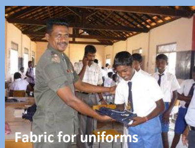
Fabric for uniforms