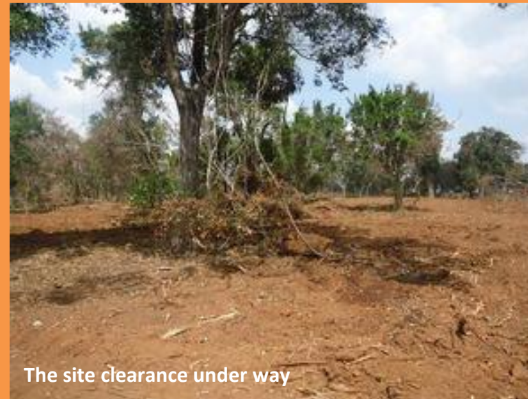
The site clearance under way